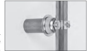
Extend stand-off distance with 1" CTS.